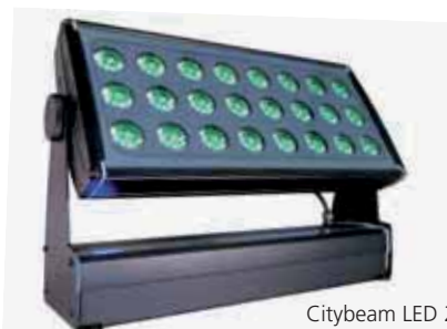
Citybeam LED 24