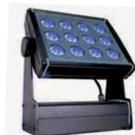
Citybeam LED 12

RGBW/full color venues buildings large facade IP66 bridges art installations concerts opening efficient light theatres shops max 168 LEDs wireless outdoor temporary events RGB/fc