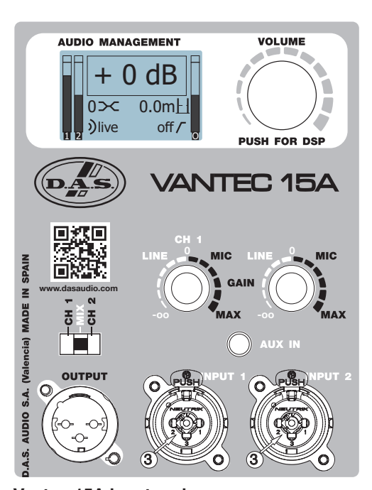
Vantec 15A input and control panel

NOTES. Frequency response: referred to 1 m; low end obtained through the use of near field techniques; one-third octave smoothed for correlation with human hearing.